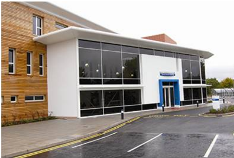
NHS Treatment Centre (Emersons Green) opened November 2009